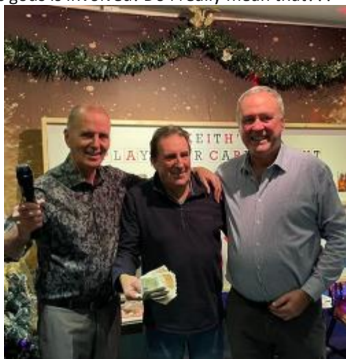
The effect of cash on men!

Now, if I believed in Stribog, the Slavic God of winds, sky and air who ripped the roof off my garage and deposited it in next doors garden, and has just cost me £960 to repair, then he would have made me the winner! I wouldn't have minded being nice to him, praising his existence and forking out the extra £60 if he had made it a tit for tat situation. Honestly, I wouldn't have minded at all. Sometimes, this winning stuff can be highly non-prejudiced if a garage roof and your belief in Slavic gods is involved! Do I really mean that???